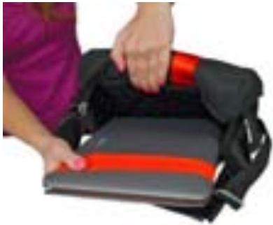
Back Compartment Zippered and padded external compartment – holds 10" tablet or 12" laptop