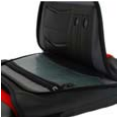
Organization Panel Front pocket low-profile organizational panel keeping pens, business cards easily accessible.

The Acme Made North Point Messenger offers a minimalist design with maximum performance. Highly weather proof, the super soft Stretch Skin™ material offers a modern look with high performance. Quilted and zippered back compartment safely holds your tablet while internal space holds your laptop. Ergonomically designed shoulder and cross body strap assures hassle free comfort and high security while on the move.