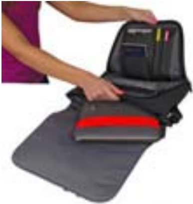
Laptop Pocket Padded interior compartment holds 13" laptop